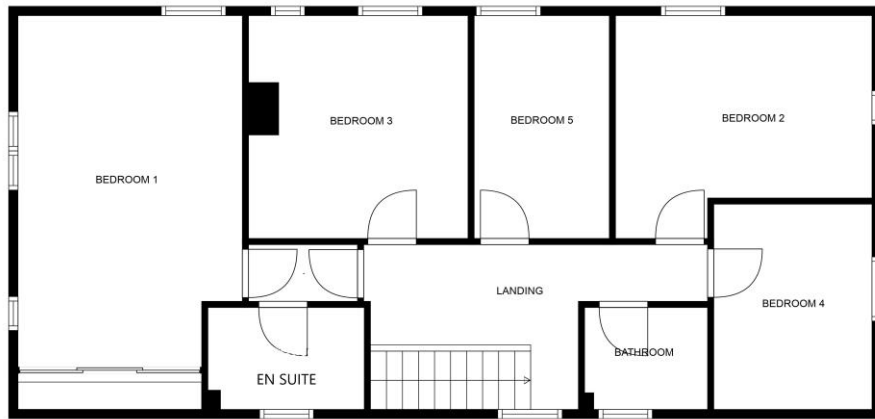
Floorplans for identification only – Not to Scale

Gross internal area: c.184 sq.m. (c.1980 sq.ft.)